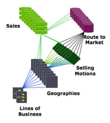
Figure 2: Map of Potential Stakeholders to be Considered in an M.O.C Plan

For each one of these components identification of possible roadblocks and potential sponsors it's of capital importance, along with accurate mapping of all