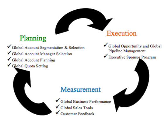
Figure 3: An Iterative Model to Implement Key Initiatives to Drive Success

The whole new structure start working: sales tools simplifying sales reps life, while keeping major steps of sales process monitored and tracked, needs to be released and deployed. Constant support to front end organization and accurate monitoring of customer feedbacks need to be coupled to rigorous tracking of main business metrics and proactive action taking for fixing potential gaps created during implementation.